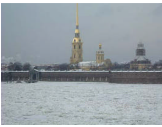
Peter & Paul Fortress across Neva River