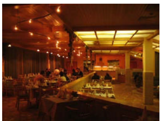
Pulkovskaya - Foyer